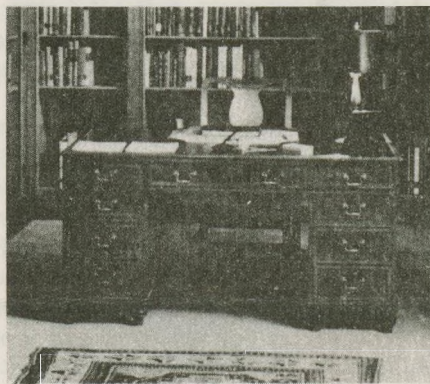
View of northeast alcove with Osler's desk.

The library is also consistently busy expanding its collections through acquisition and is particularly interested in gathering more material on