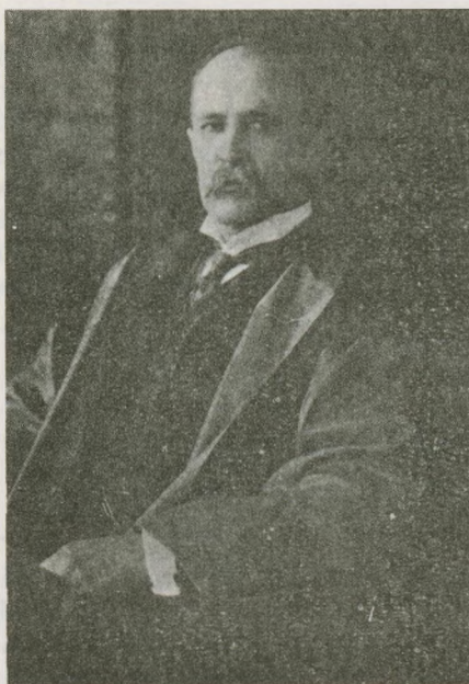
Photo portrait of Sir William Osler in academic dress, Oxford, 1908.