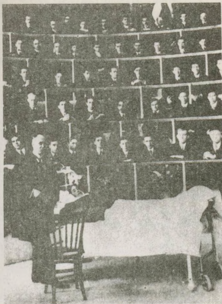
Clinic by Osler at Royal Victoria Hospital in Montreal, 1902.

he would always make time to dash up to the library and have a quick look at what was on the shelves. As his biographer Harvey Cushing remarked, "Osler's interest in libraries was cumulative, and a contact once made was never lost."